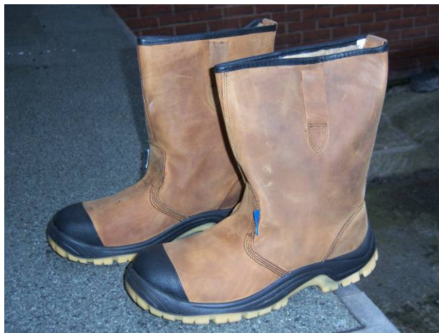
* Rigger style boots